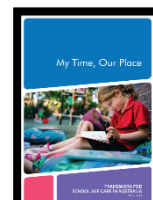
My Time, Our Place; Framework for School Age Care in Australia 2022 V2

Critical reflection: is a meaning-making process that assists informing future practice in ways that demonstrate an understanding of each child's learning, development and wellbeing and implications for equity and social justice. It involves examining and analysing events, experiences and practices from a range of perspectives to inform future planning and decision-making ( Early Years Learning Framework 2022 V2 – refer to Sources ).